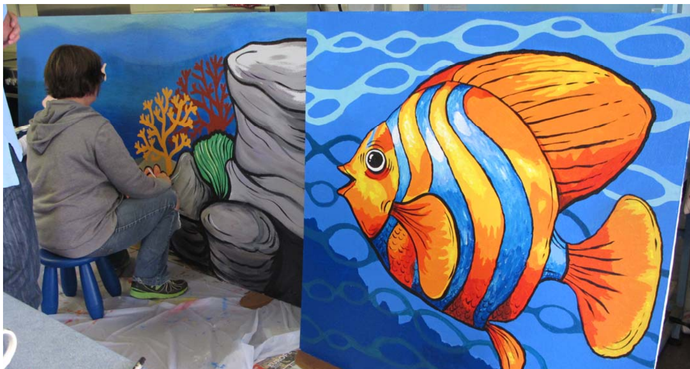
Something fishy was happening in the cooking craft room this week.

parade to see all the fantastic designs and join in all the fun. Following the Autumn Hat Parade will be the Junior Assembly. The day has been moved due to Good Friday. The junior Assembly will commence at 12:30pm.