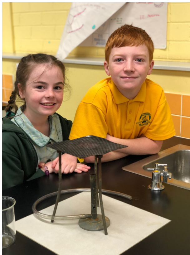
Bowral High school visit.