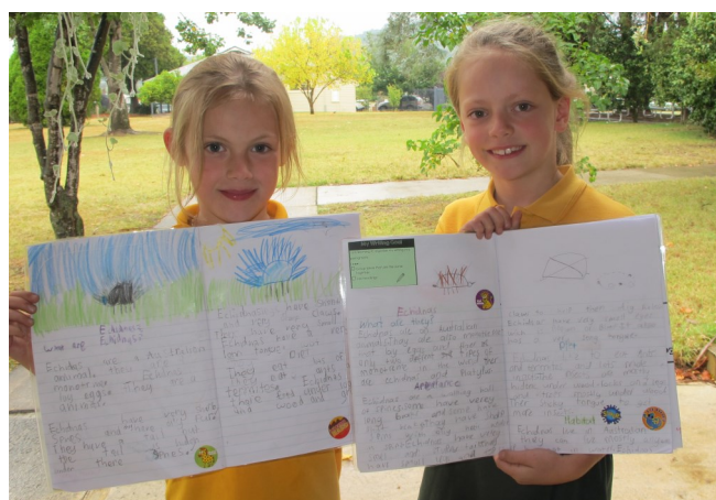
Students showing us their great work!